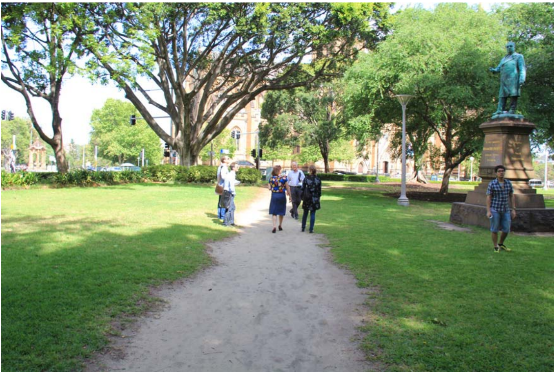
Image b) Informal tracks through the grass created along pedestrian desire lines.